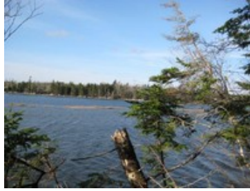
Enjoy Great Sunsets!

http://anitahome.ca/properties/434/ Anita Wintzer - anita@coastalwindsrealty.com