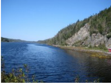
Water Front Lot