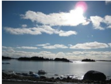
Sunsets & Harbour Access

http://anitahome.ca/properties/457/ Anita Wintzer - anita@coastalwindsrealty.com