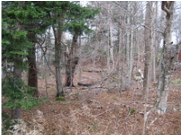
Lake Echo Building Lot

http://anitahome.ca/properties/353/ Anita Wintzer - anita@coastalwindsrealty.com